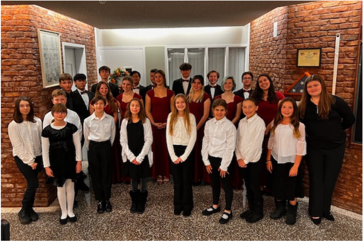
ABOVE: The McGee Sound Express & BHS Madrigal Singers performed at the town's annual Swearing-In Ceremony for newly elected officials in November. BELOW: The McGee 7th & 8th Grade Spartan Band performed a diverse and entertaining winter concert for a packed house in the McGee Auditorium.