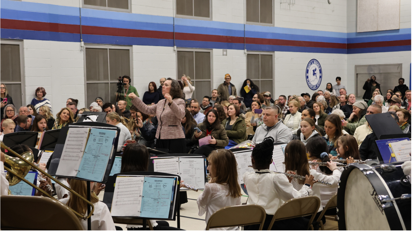
The Griswold 4th and 5th Grade Band performed their Winter Band Concert in mid-January. Students demonstrated newfound musical skills and performed with precision and excitement!