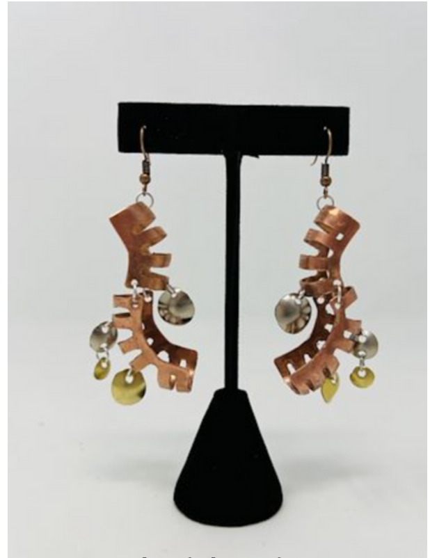
Celestial Earrings Chloe (Cal) Constantine